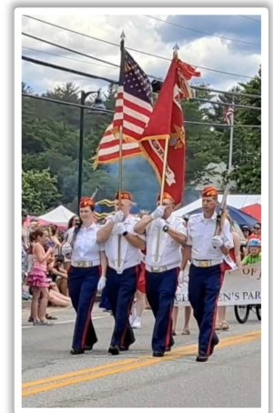
Leading Parades across Merrimack County