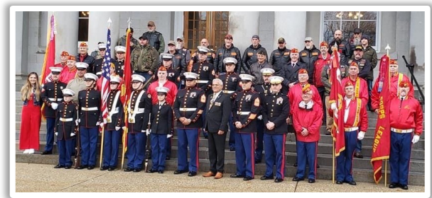
Flag raising over the state house, Nov 10 th